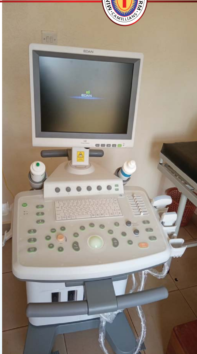
The four probe ultra-sound scan at St. Camillus Health Centre

As mentioned above, the facility has a multipurpose scanning machine with four probes which does a wide range of examinations and measurements. The ultra-sound machine does the following; Cardiac echo, scrotal scanning, breast scanning for masses, abdominal and pelvic scanning, endo-vaginal scanning, peripheral vascular, obstetrics etc.