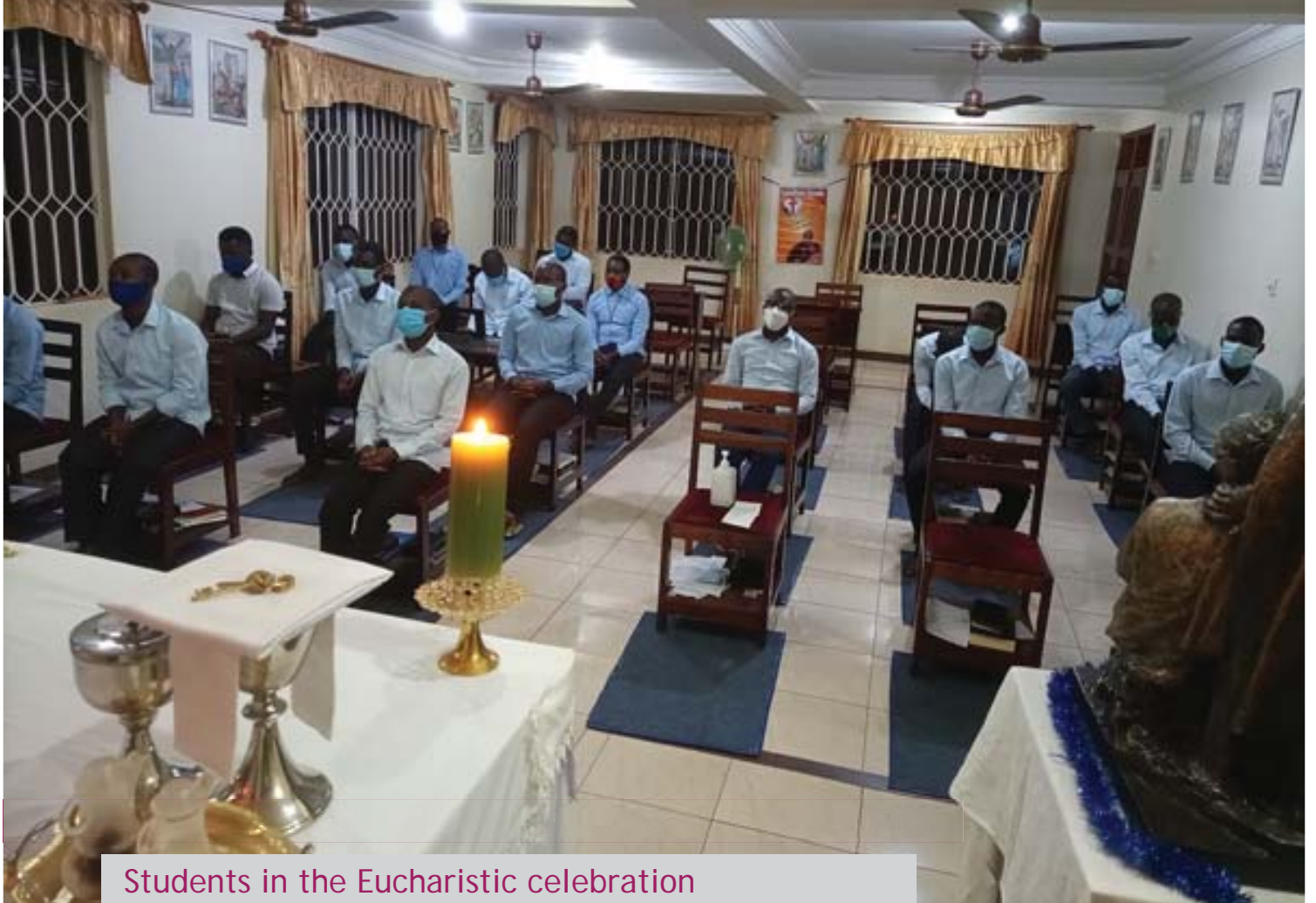
Students in the Eucharistic celebration