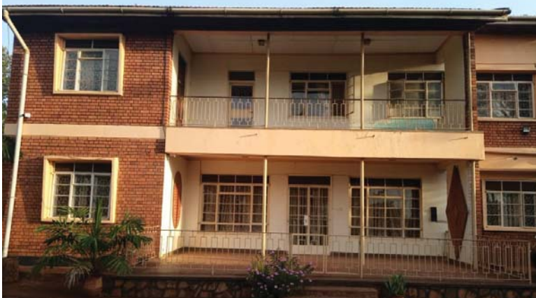
Camillian first house at Kiira road Jinja