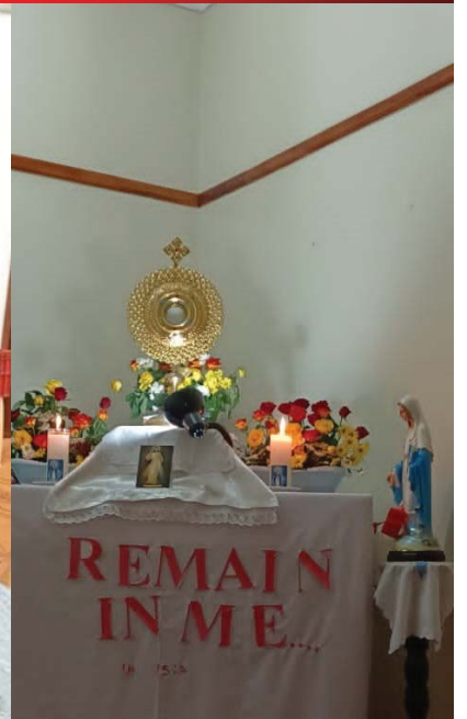
Novices in Eucharistic Adoration