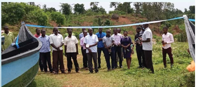
Community during the blessing of boats at the Anniversary