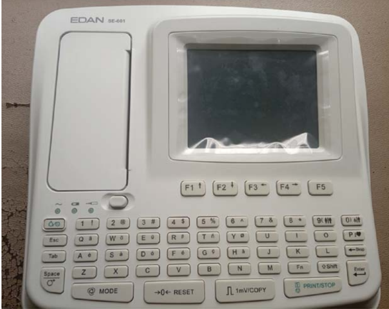
The ECG Machine at St. Camillus Health Centre