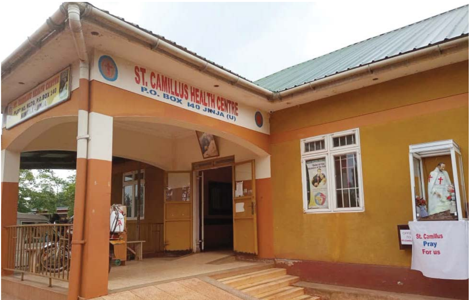
Part of the structure of St. Camillus Health Centre