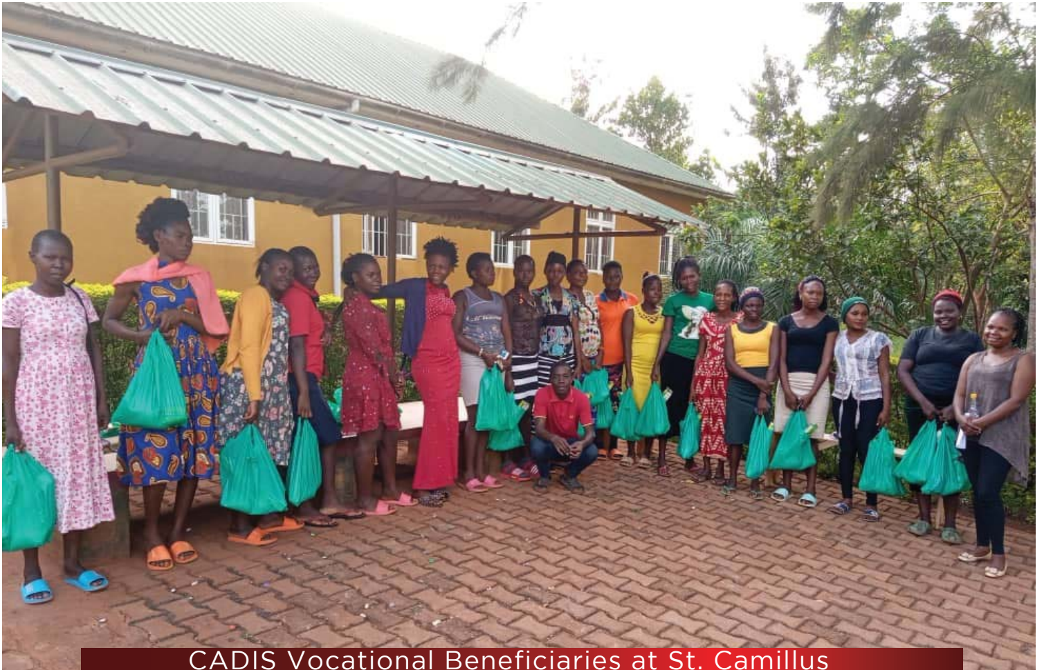
CADIS Vocational Beneficiaries at St. Camillus