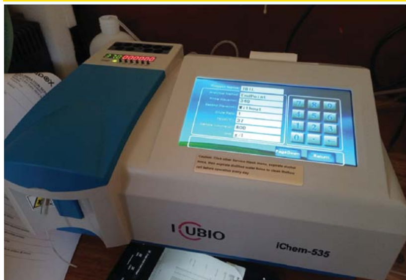
The Chemistry machine in operation

In addition, the Laboratory has a chemistry analyser that carries out number of chemistry tests. The analyser performs the following; Liver Function Tests (LFTs), Renal Function Tests (RFTs), Lipid Profile (good and bad cholesterol) in our bodies. It also does electrolytes such as sodium, potassium, chloride, iron etc. besides that, the laboratory performs many other routine tests.