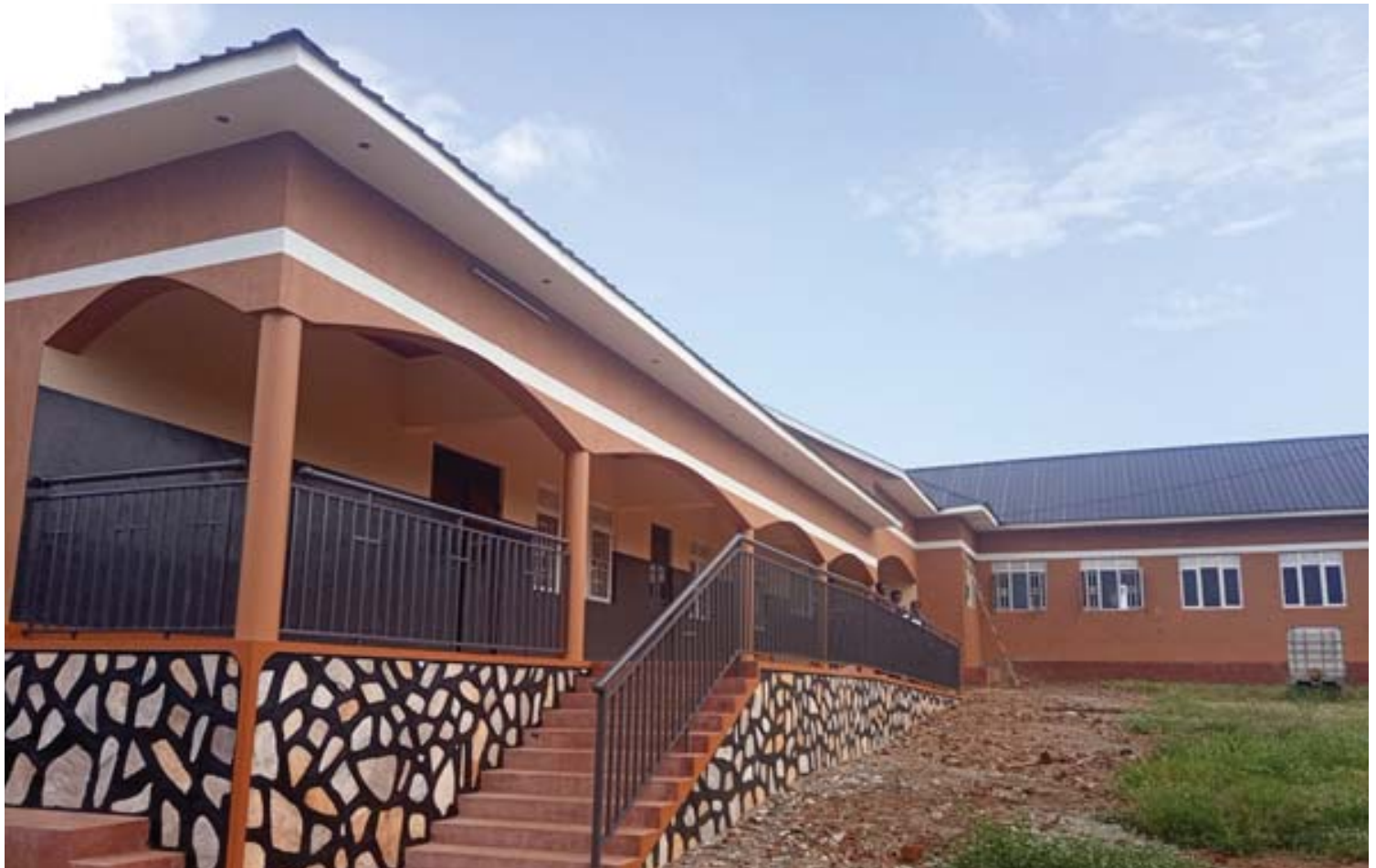
Musoli medical centre during construction supported by CADIS

We are also present in Mayuge district where we have a developing medical centre with a small farm mainly for poultry and piggery.