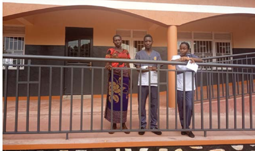
Two medical staffs and a support staff at Musoli medical centre

As of now, the health Centre has two medical personnel, two support staffs and a manager.