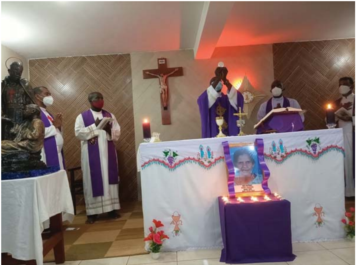
Community offering the Eucharistic Celebration for the deceased mother