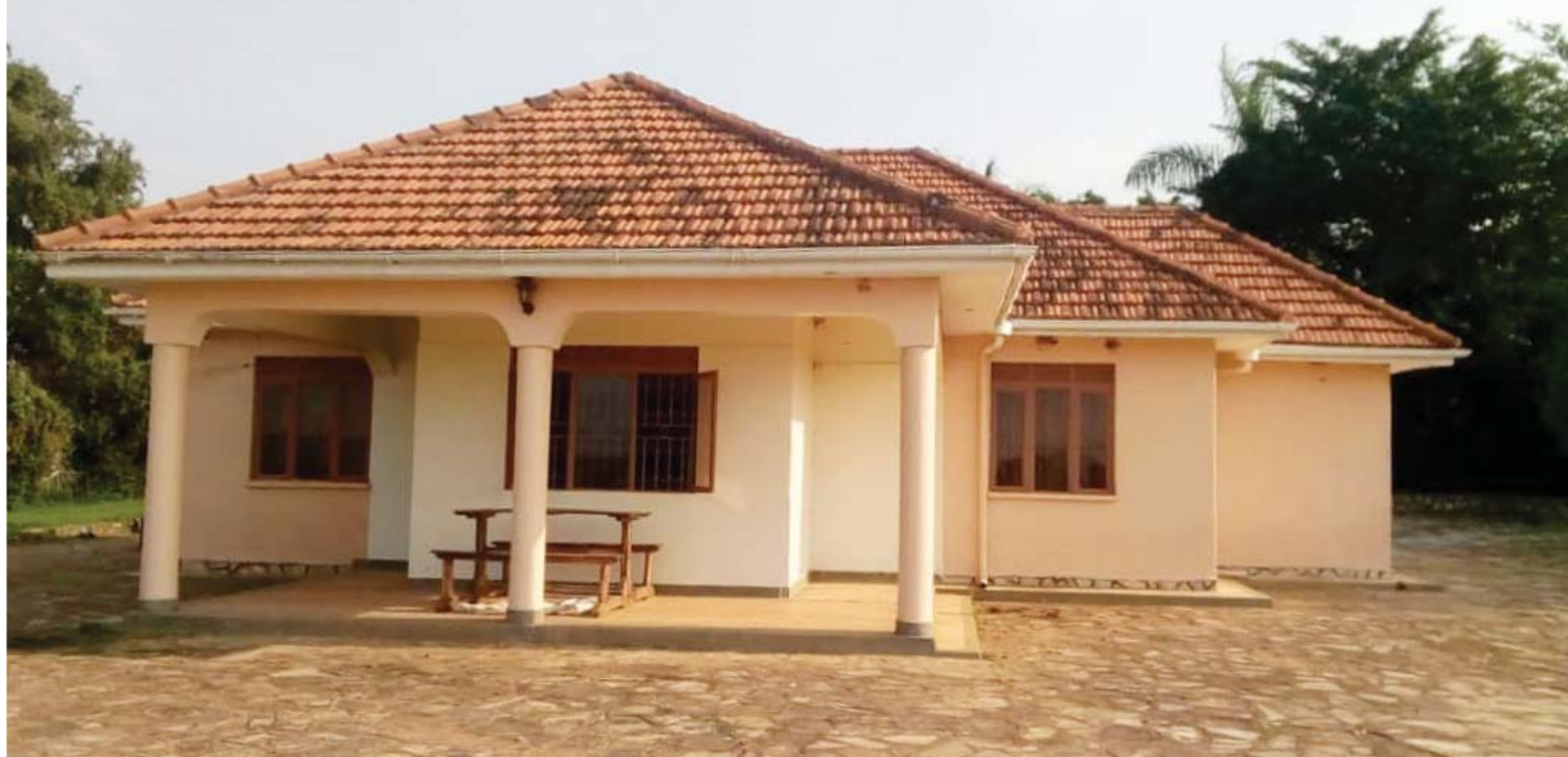
Camillian House in Masaka

We are present in Masaka District where we have a farm. Lastly, we are in Fort Portal in Western Uganda where we have a community for the professed who are undertaking their theological studies.