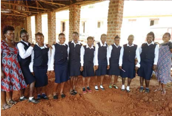
Kimaka Pro-sa Vocational Training Beneficiaries