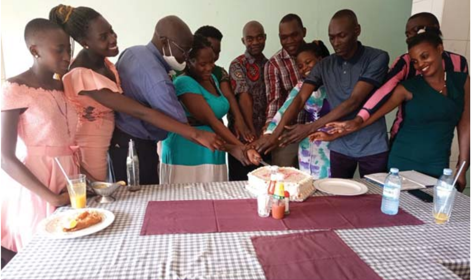
— Staffs celebrating charismas party December, 2021 —