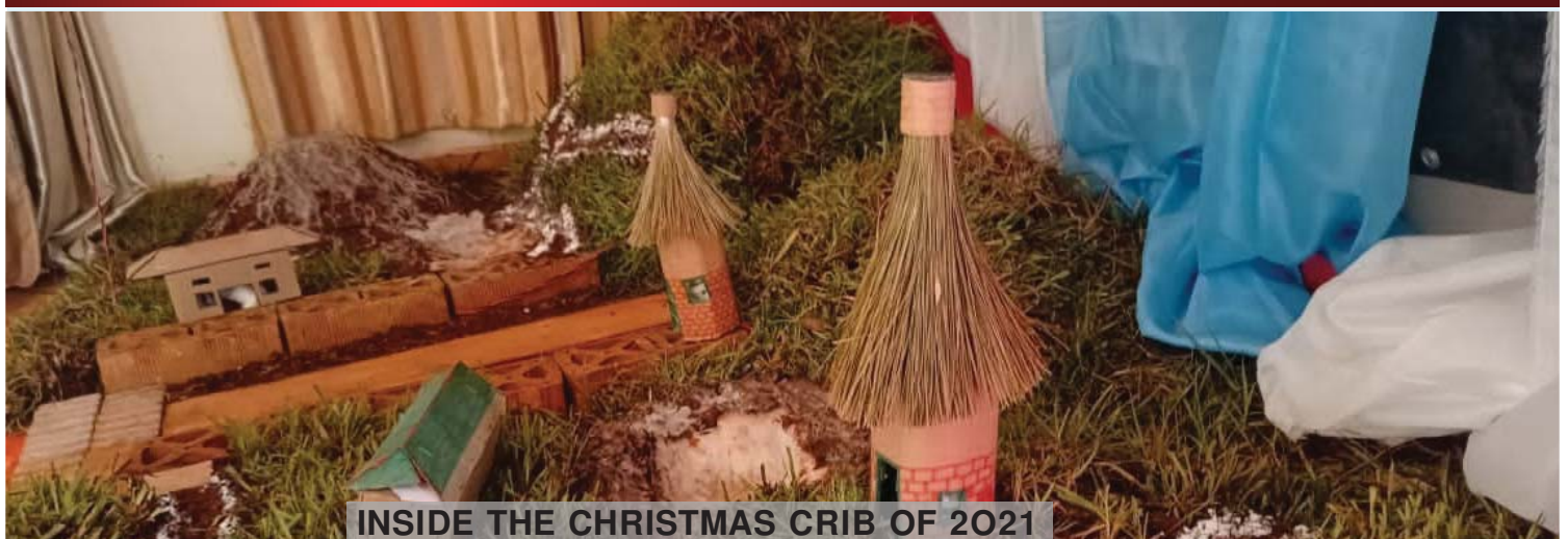
INSIDE THE CHRISTMAS CRIB OF 2021