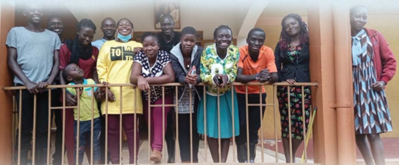
The friends of St. Camillus Health Centre after a cleaning exercise

The collaboration and support from benefactors like Pro-sa has sustained this facility and equipped it with modern machines such as the ultra-sound scan, chemistry machine, all covid related equipment among others. This has greatly boosted the performance of this facility. The following are some of the services offered at St. Camillus health centre;